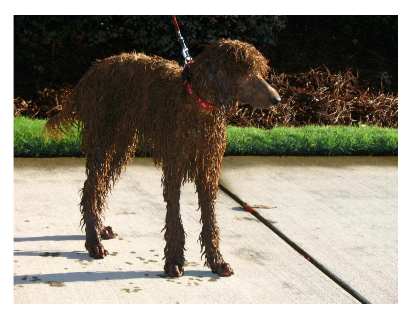
Please submit your cute photos for publication. Each month, we will select one that should make you smile.