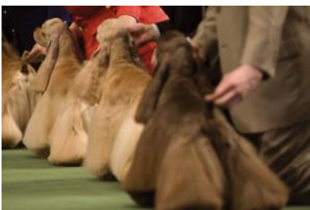
138 - April, 2015

by Gerry Meisels (reprinted with Permission of Canine Cronicles – April 17, 2015)